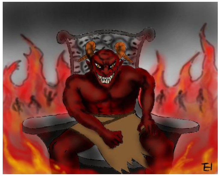
There is a price for sin!